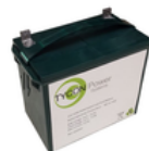
AGM 12V Battery