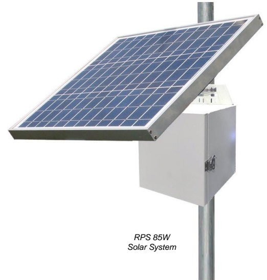
RPS 85W Solar System